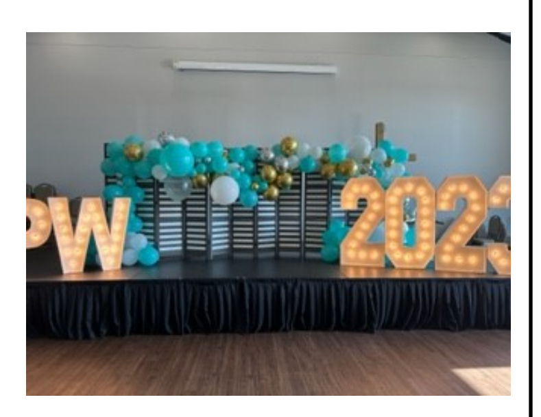
But where were you?