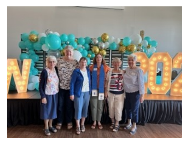
HAD A BLAST AT Spring Gathering at Nor'kirk in May!